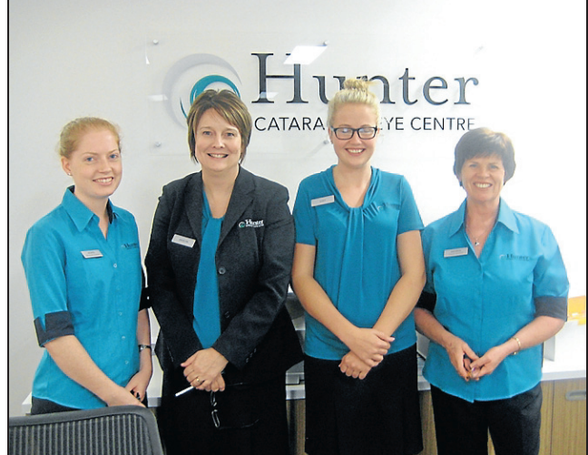
CUTTING EDGE: Hunter Cataract and Eye Centre has relocated from Hamilton to Charlestown and changed its name from Denison Street Eye Surgeons.